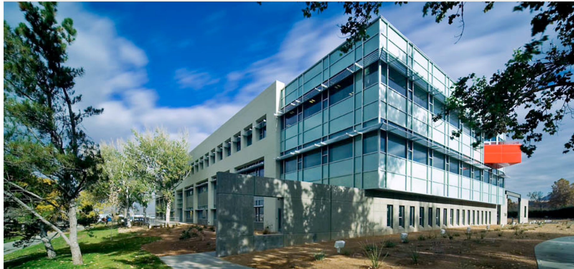
Jefferson Green, DPS's headquarters building – the first LEED Gold commercial building and the largest, most energy efficient LEED building in New Mexico at its opening

Source: EPA Greenhouse Gas Equivalencies Calculator