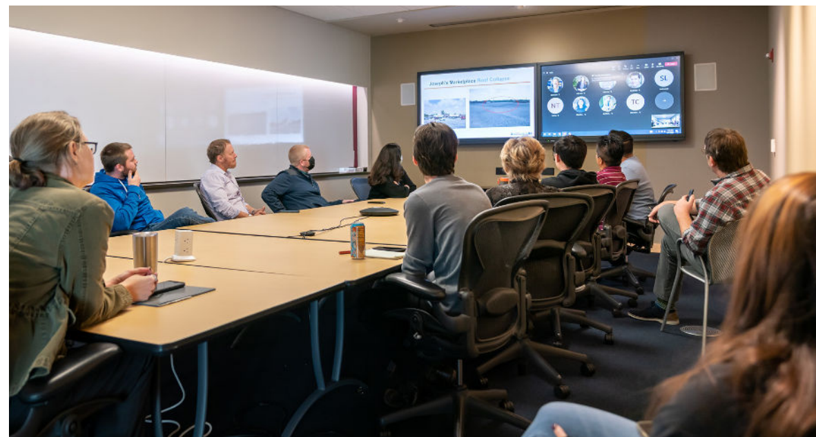
Friday Focus Presentation