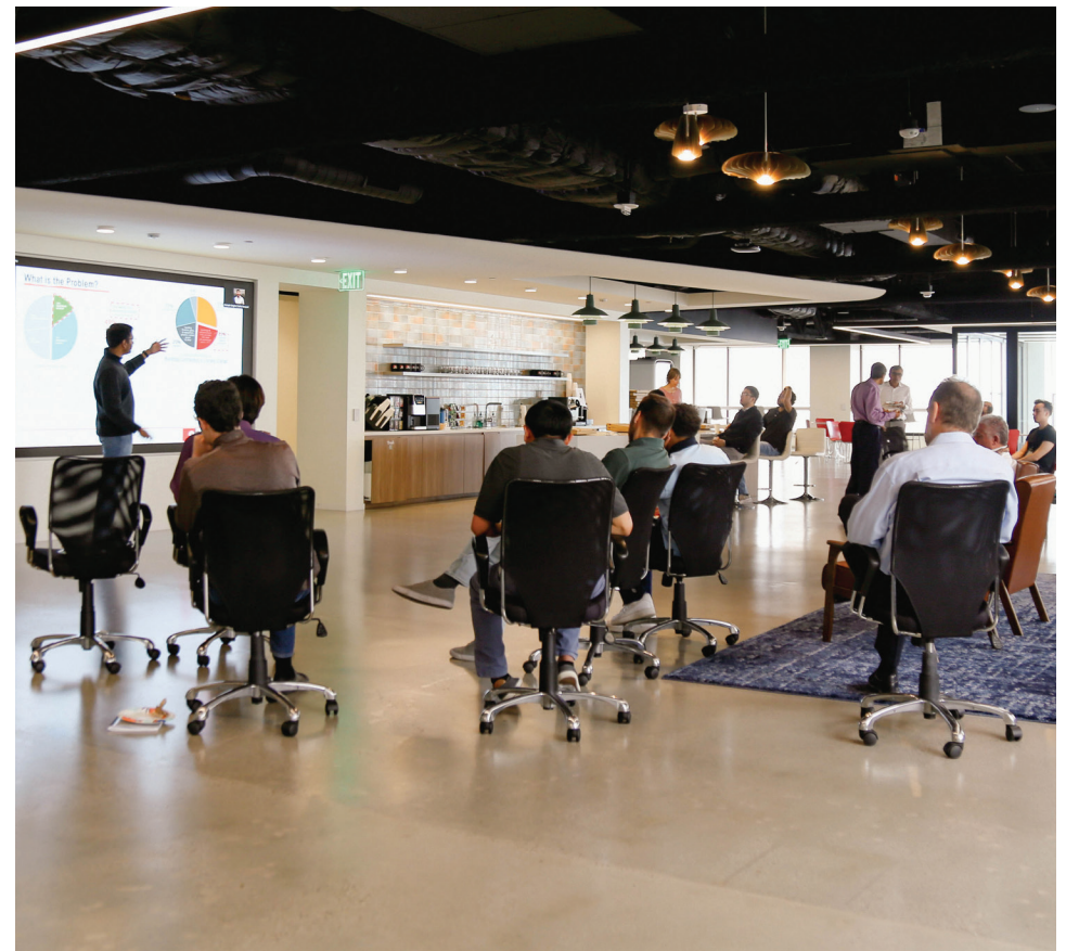
Internal meeting at the Saiful Bouquet headquarters in Los Angeles

Participating in Seminars and working sessions – Since 2023, participating in seminars and networking events has given our team valuable opportunities to connect with like-minded professionals who are passionate about sustainability. These interactions foster connections and collaborations that enhance our collective knowledge. Our Sustainability Committee actively reports back to the firm, ensuring that the latest insights and innovations in sustainable practices are shared and integrated into our projects. Looking ahead, Saiful Bouquet aims to co-chair a hub such as the Carbon Leadership Forum (CLF) Regional Hub to further engage with the sustainable design and engineering ecosystem.