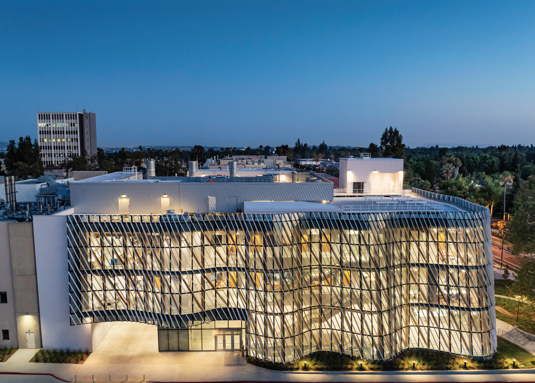
Caltech Resnick Sustainability Institute