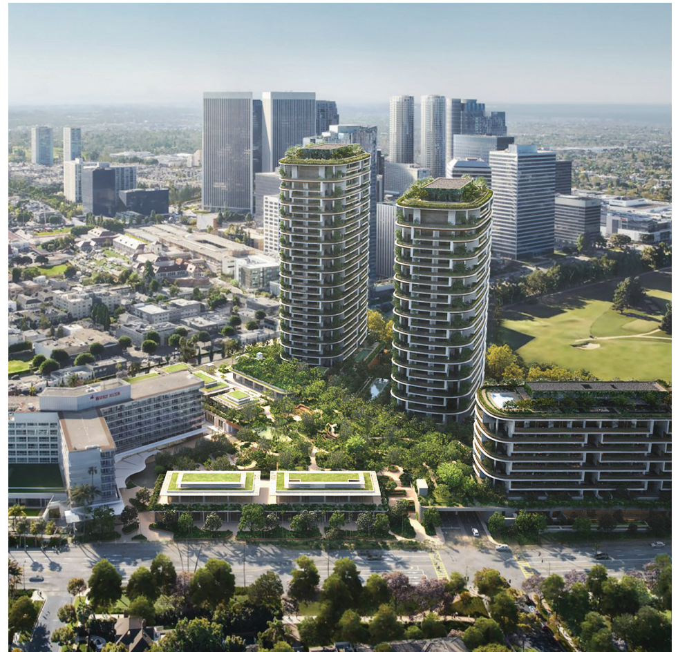
The One Beverly Hills development is designed to set the standard for future green development

The material quantities are primarily based on the Revit modeling . For determining material quantities for reinforcement, structural elements are assigned with their corresponding rebar densities such that the total rebar quantity per element is calculated. Similarly, structural steel elements are assigned with a multiplier to account for miscellaneous steel required for connections and other details that will not be captured in the structural Revit model.